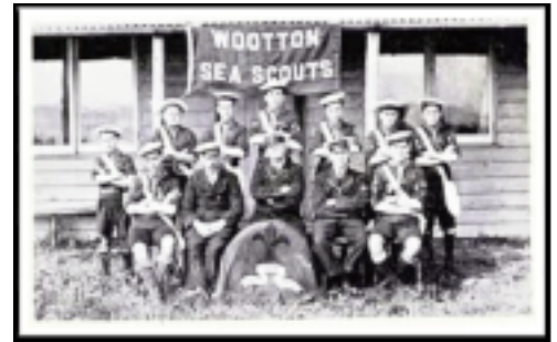
Wootton Sea Scouts dated 1916