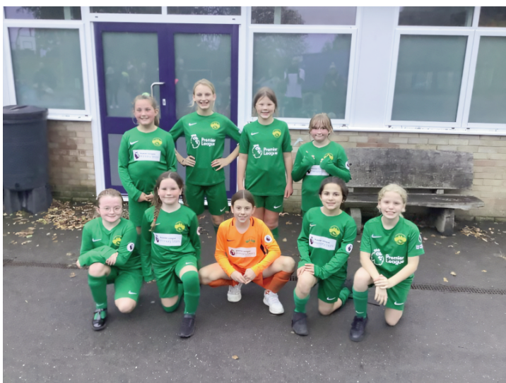
Wootton Primary U11's Girls Football Team

end-to-end with neither team really dominating. It made an exciting, but nervous watch. The girls started the game positively and with energy, which is not always easy. Especially against a side, that has already played their first match of the afternoon. It was perhaps fitting that it ended 0-0.