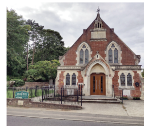
Wootton Bridge Methodist Church

love to see you, to meet you; ok, it's a difficult thing crossing over the threshold of a church if you haven't been before, however, the people are friendly. There is a sense of purpose and belonging, just people, like everyone else, looking for answers, having troubles, up against it. There is unity in their hope and belief of a better life, one promised by knowing that baby in a manger, all grown up into the man Jesus. So, this Christmas, perhaps take a chance on something different this Christmas time, pop in and meet us. 'For a child has been born for us, a son given to us; authority rests upon his shoulders; and he is named Wonderful Counsellor, Mighty God, Everlasting Father, Prince of Peace'. Isaiah 9: 6